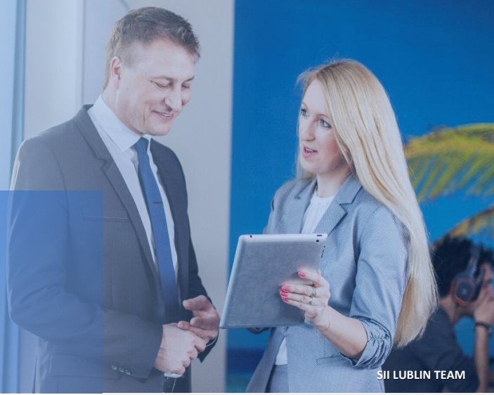
SII LUBLIN TEAM