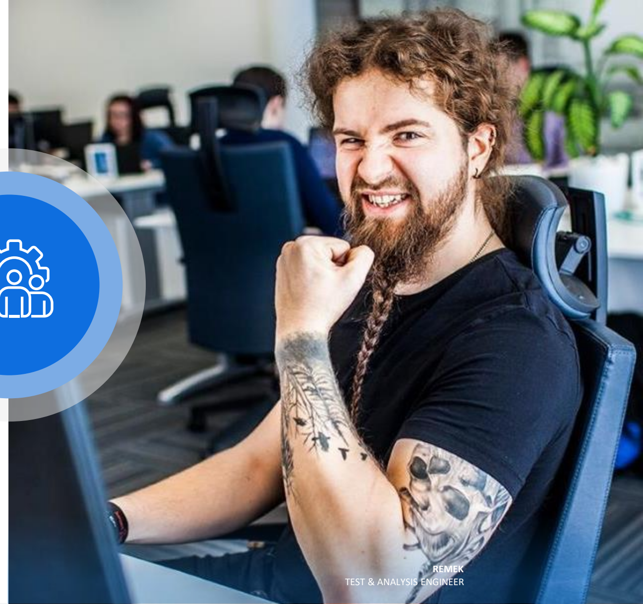
REMEK TEST & ANALYSIS ENGINEER